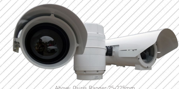
Above: Osiris Ranger 25-225mm Other models will vary