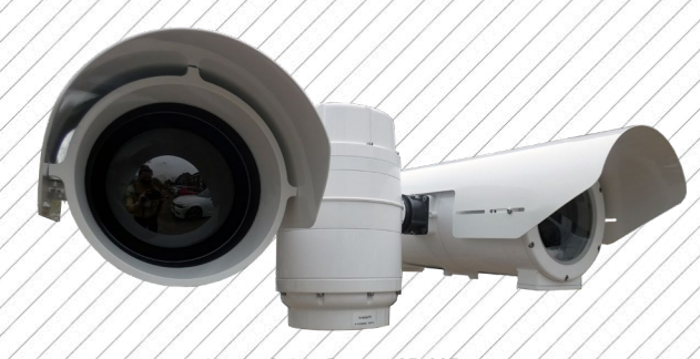
Above: Osiris Ranger 25-225mm. Other models will vary.

26mm to 105mm 25mm to 150mm 25mm to 225mm